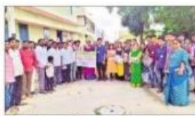
ప్లాస్టిక్ వద్ద కలిగే అసర్వాలపై అవగాహన కలిగిస్తున్న గీతాంజలి కళాశాల విద్యార్థులు