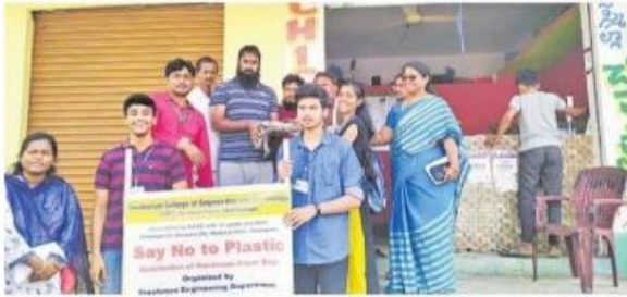
చీరగల్లో ఓ చిత్రన్ షాపు యజమానికి పేపర్లు అందజేస్తున్న విద్యార్థులు

చీరగల్: 'ప్లాస్టిక్ వద్దు... పర్యావరణ ముప్పు' అని విద్యార్థులకు ప్రజలకు ప్లాస్టిక్ పై అవగాహన కల్పించారు. ఈ మేరకు మంగళవారం మండల పరిషత్లోని చీరగల్ గ్రామ గీతాంజలి కళాశాల విద్యార్థులు ప్లాస్టిక్ వాడకంపై చీరగల్ గ్రామంలో ర్యాలీ నిర్వహించారు.