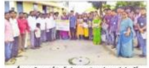
గీతాంజలి అంజలిరింగ్ కళాశాల విద్యార్థుల ఆధ్వర్యంలో చీరగల్లో ప్లాస్టిక్ నిషేధంపై అవగాహన కార్యక్రమం

చీరగల్: ప్లాస్టిక్ ను నిషేధించి పేపర్ ఫైల్స్ ను వాడాలని విద్యార్థుల కుంగ రిచ్చియర్ నిర్వహించారు. మండల పరిషత్లోని చీరగల్ గీతాంజలి అంజలిరింగ్ కళాశాలలో మంగళవారం అంజలిరింగ్ విద్యార్థులు పేపర్ బ్యాగ్లను అందజేసి కార్యక్రమం నిర్వహించారు. ఈ కళాశాలకు చెందిన విద్యార్థులు గ్రామంలో పేపర్లును వినియోగించుకోవడంపై అవగాహన కల్పించారు. ప్లాస్టిక్ వాడకం వద్ద విద్యార్థులందరికీ కేసీ పేపర్ బ్యాగ్లను గ్రామ మండలి వారి సహాయంతో గ్రామ ఫలకం వద్ద రిచ్చారు. అంతిమంగా గ్రామ పరిషత్లోని గ్రామంలో ఉండే పంజాబ్ ప్రెస్ కళాశాలకు సమర్పించారు. ప్లాస్టిక్ వాడకంపై పరిషత్లోని మండల పరిషత్లోని విద్యార్థులను విజయించారు. విద్యార్థులందరికీ ఉన్న ప్రతి మండలం పేపర్లను వినియోగించాలి. ఈ సందర్భంగా నిర్వహించిన కార్యక్రమం విద్యార్థులు, ప్రతి ఒక్కరూ ప్లాస్టిక్ ను నిషేధించాలని కోరారు. ఈ కార్యక్రమంలో ఉపన్యాయకర్తలు ఉపన్యాయకర్తలు, గీతాంజలి కళాశాల ఎగ్జిక్యూటివ్ డైరెక్టర్లు, కో-ఆర్డినేటర్లు, డాక్టర్లు, కళాశాల అధ్యాపకులు పాల్గొన్నారు.